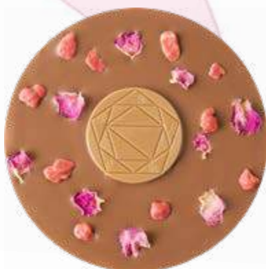
ROCK 'N' ROSES Art. No. 24176 Milk Choco + Praline + Almonds + Roses

A sweet chocolate ballad: one sweet milk chocolate disc with a smaller, tender-melting almond praline disc sitting in the middle. Decorated all over with fragrant, pink rose petals and roasted almonds covered with a fruity raspberry couverture and a touch of rose oil. The stunning pink colour is derived entirely naturally from raspberries alone.