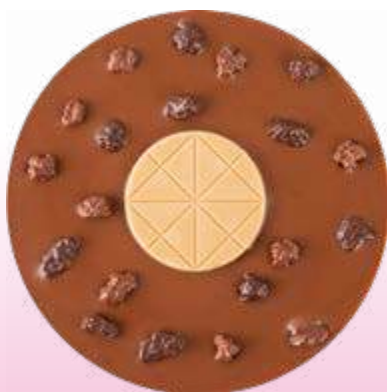
TOTALLY NUTS Art. No. 24130 Hazelnut Praline + Cashew Praline + Nuts

Nuts – crunchy & tender-melting: a nutty disc, created with a mix of hazelnut praline and milk chocolate, combined with a smaller cashew praline disc. The two types of praline are made directly at our chocolate factory using freshly roasted nuts. Decorated all over with crunchy hazelnuts dunked in dark chocolate and walnuts coated in milk chocolate.