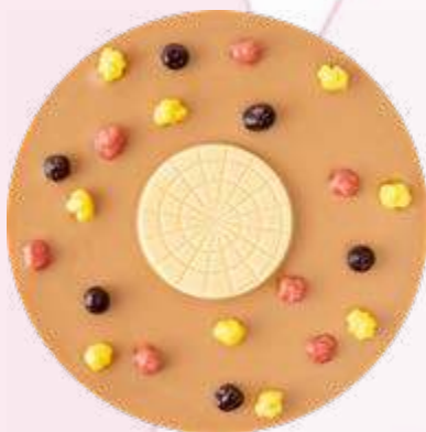
RAINBOW Art. No. 24177 Milk Choco + White Choco + Crunchy Fruit

Sweet & colourful, just like life itself: one disc made of milk chocolate and a smaller one made of sweet white chocolate. Decorated brightly all over with crunchy, chocolatey fruit: crispy strawberries in a pink strawberry couverture, passion fruit in a sunny, yellow passion fruit couverture and blueberries in a purple blueberry couverture, all of their stunning colours derived entirely naturally from berries and other fruit.